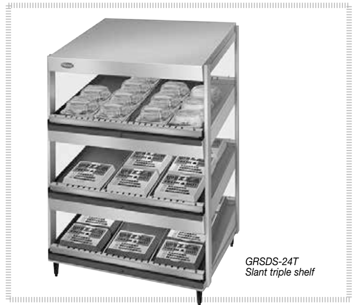
GRSDS-24T Slant triple shelf

Project _____ Item # _____ Quantity _____